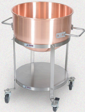
Kettle on Mobile Dolly

ACCESSORIES : Not included in the LifTILTruk A Pricing