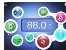
Intuitive touchscreen display