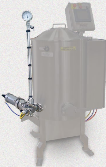
Integrated Transfer Pump

For continuous pump transfer operation, use the Savage Bros Integrated Transfer Pump. The control module is integrated into the PLC Touchscreen of the Chocolate Temperer. It features an adjustable deposit amount, up to 6 oz per stroke, 6 lb chocolate transfer per minute.