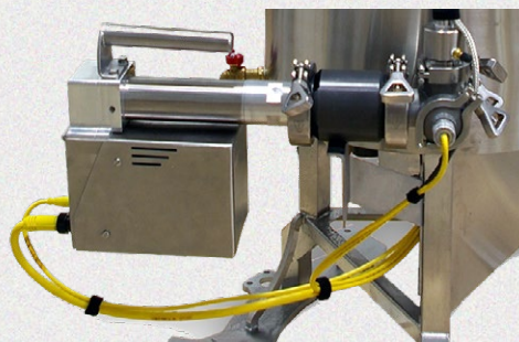
Integrated Depositing Pump

For continuous pump transfer operation, use the Savage Bros Integrated Transfer Pump. The control module is integrated into the PLC Touchscreen of the Chocolate Temperer. It features an adjustable deposit amount, up to 6 oz per stroke, 6 lb chocolate transfer per minute.