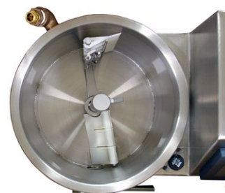
Removable agitator with bottom and sidewall scraping action