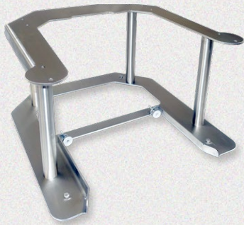
Universal Depositor Table Stand