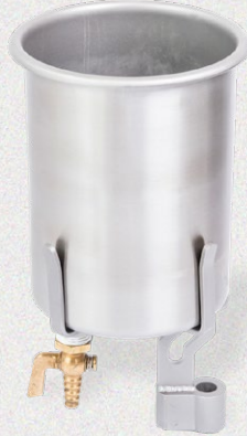
Cream Can Assembly