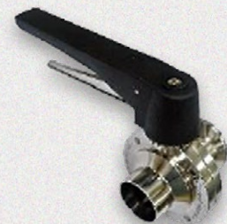
Draw Off Sanitary Valve