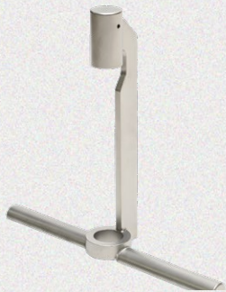
Nut-Stirrer Agitator 2-Blade